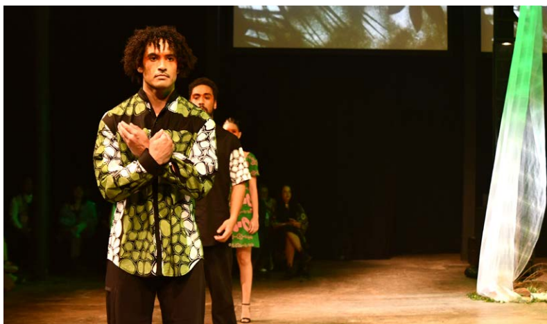
*Lisa's 'Nener' collection on the runway at the CIAF Fashion Show in 2024.